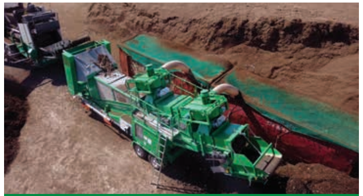
Efficiently separate plastic contamination directly into external containers for simple and easy disposal.