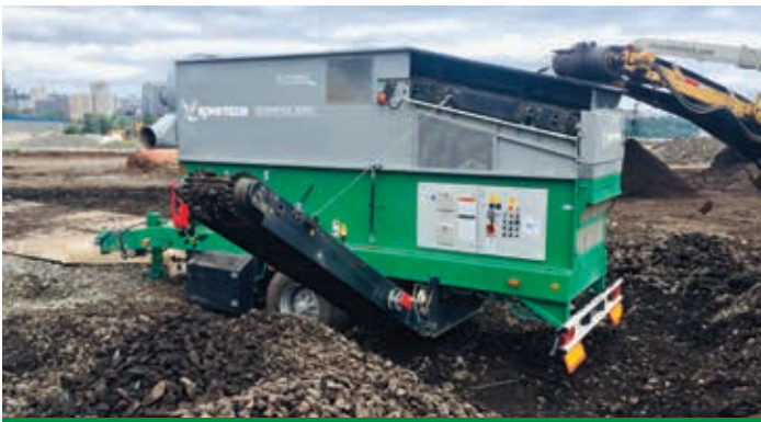
Using a patented system of pressure and suction blowers, the Stonefex removes up to 95% of stones and heavy objects from your material.